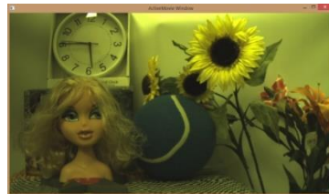
Camera Tool view mode