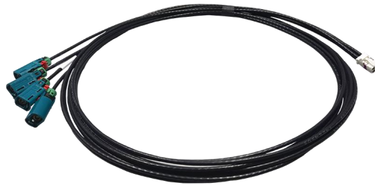
MATE - AX TO AUTO FAKRA