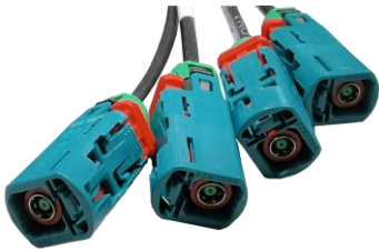
AUTO FAKRA QTY: 4 IP Rating: IP67