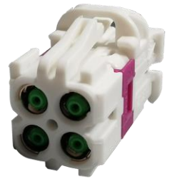
MATE – AX QTY: 1 Waterproof: No