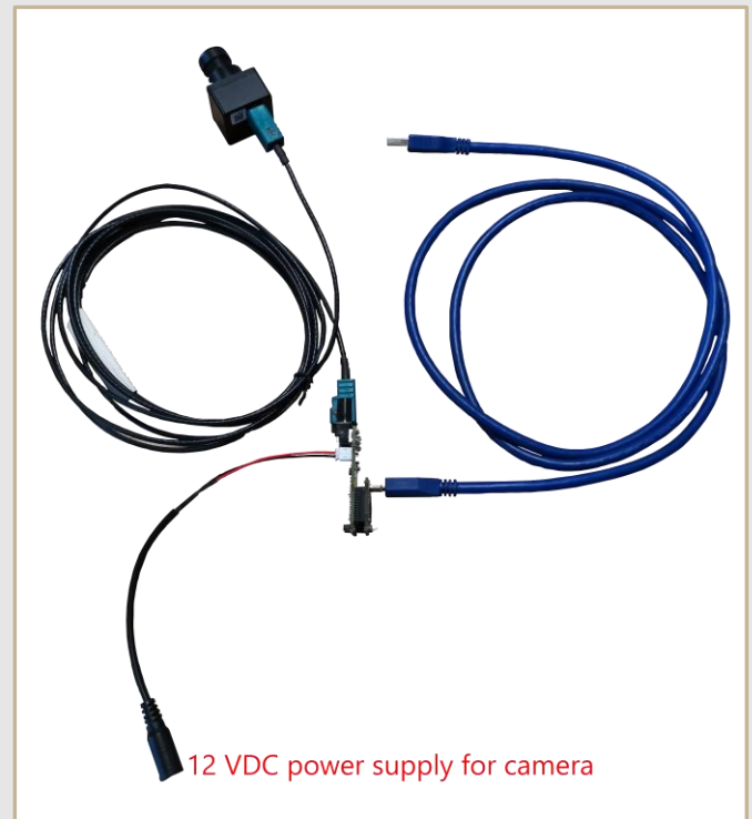
12 VDC power supply for camera